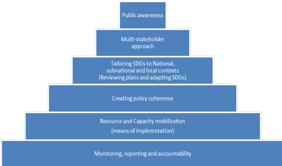
Figure 1: Stages for adaptation of SDGs into national context

Review mechanisms and processes at the national level will include internal review, external review, peer review, inputs and information from audit and oversight agencies, and evaluations of systems, policies and programs. Figure 1 below presents the summary of stages for adaptation of SDGs into national context.