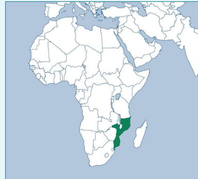
Map of Mozambique, Irish Aid, 2015