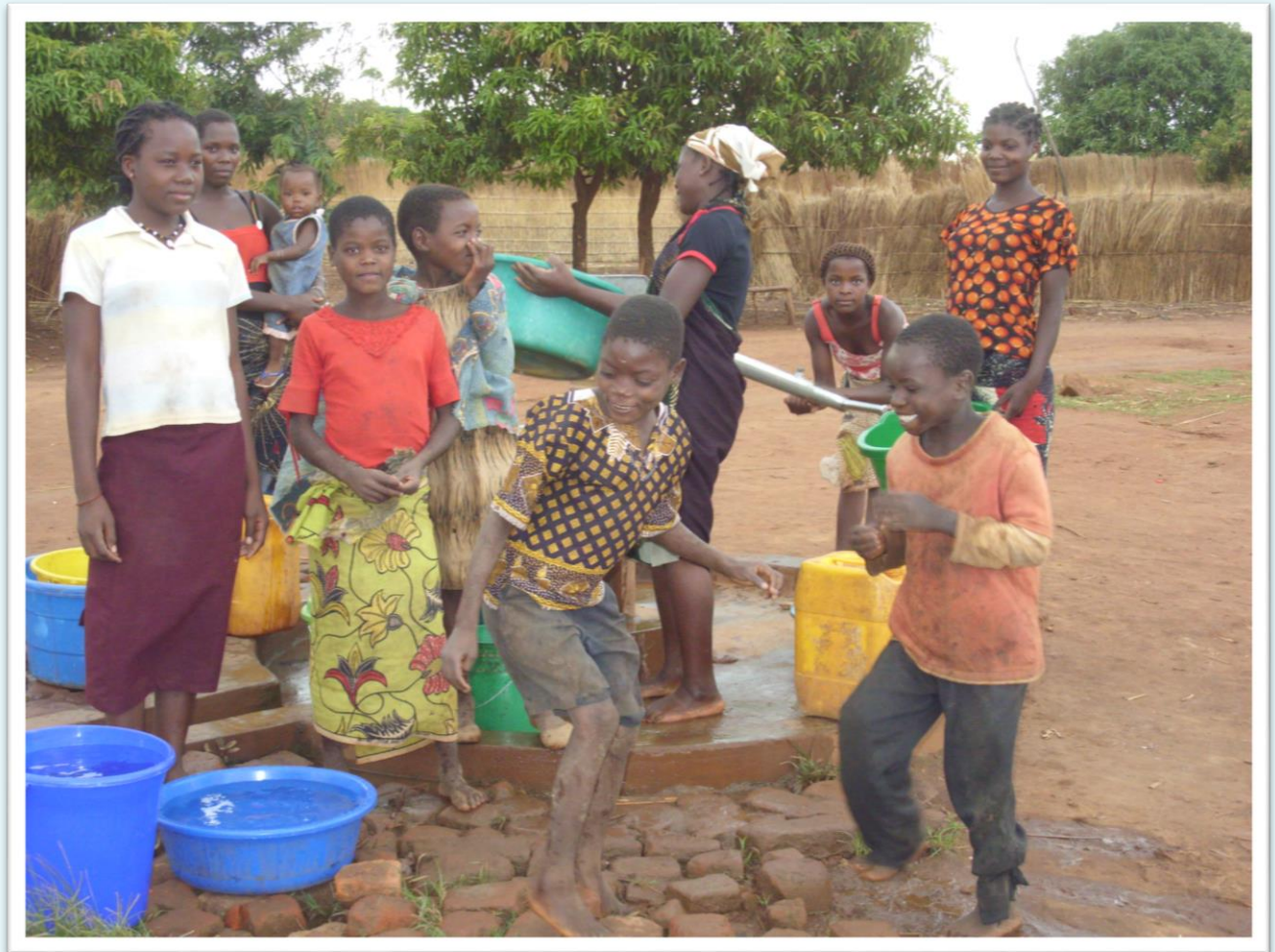
Mothers and children at water source placed near health post in Niassa Province, Tanzania.